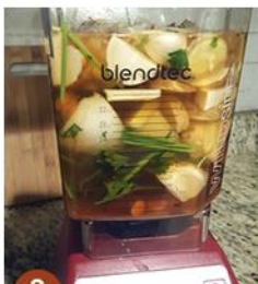
3 Add ACV and blend until chunky.