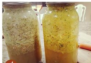
4 Place in quart jar(s). Fill up rest of way with ACV. Keeps in fridge for 6-12 months.