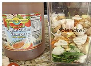
2 Place in blender.