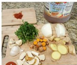
1 Chop into large chunks.

Ingredients: 1/2 onion, 1/4 bunch parsley, 1 cup fresh ginger, 1 cup fresh horseradish, 1/4 cup fresh turmeric, 1/2 to 1 head garlic, pinch of cayenne, & approx. 6-8 cups of raw apple cider vinegar.